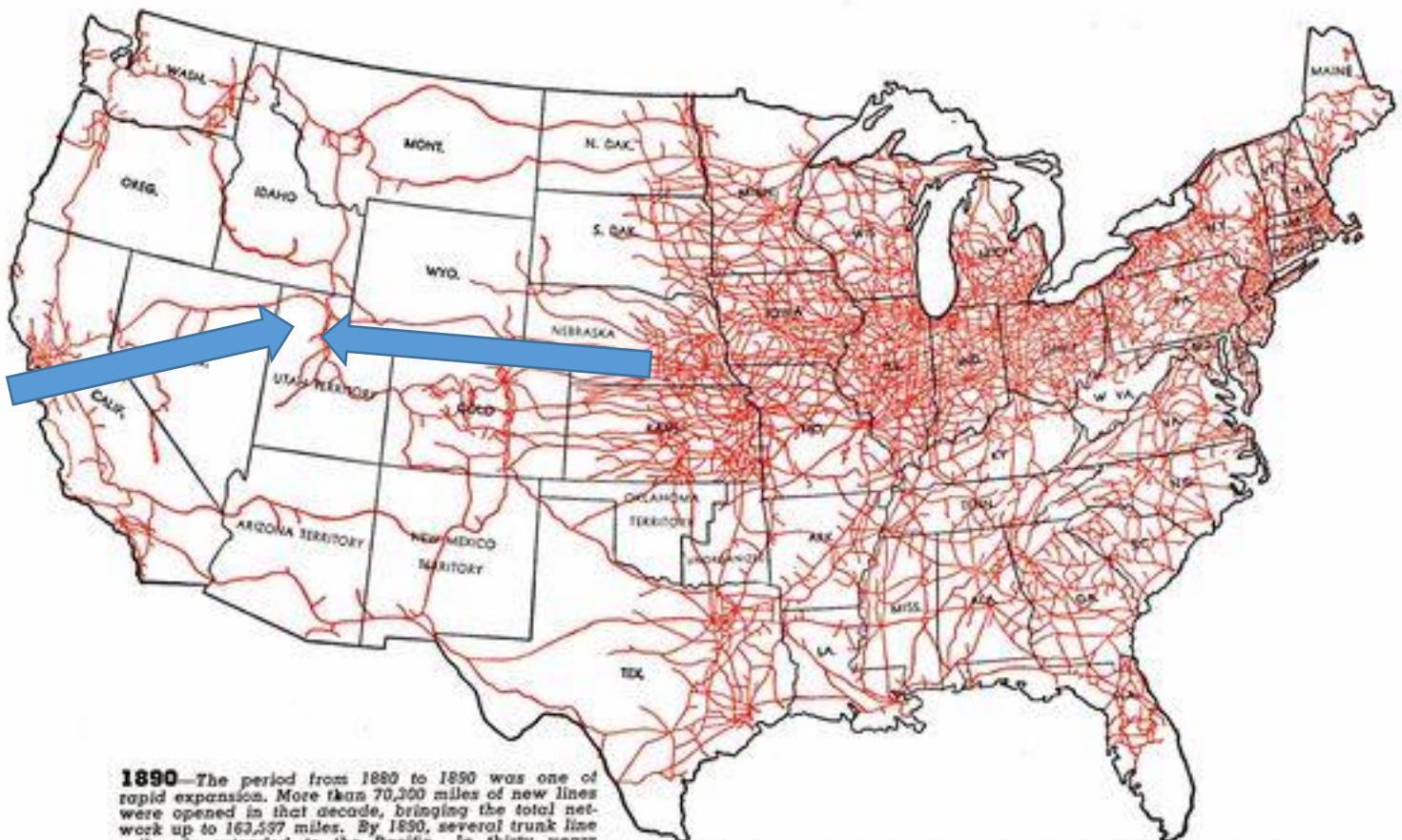
1890 —The period from 1880 to 1890 was one of rapid expansion. More than 70,000 miles of new lines were opened in that decade, bringing the total network up to 163,557 miles. By 1890, several trunk line railroads extended to the Pacific. In thirty years from 1860 to 1890, the total mileage of the region west of the Mississippi River increased from 2,175 to 72,389, and the population of that area increased fourfold.